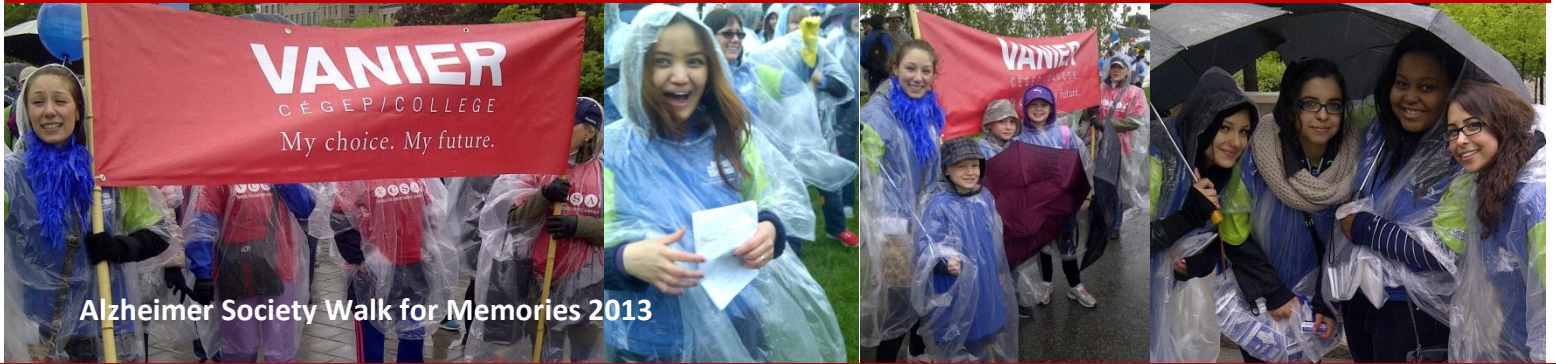
Alzheimer Society Walk for Memories 2013

Volume M 11, Issue No. 1, August 26, 2013